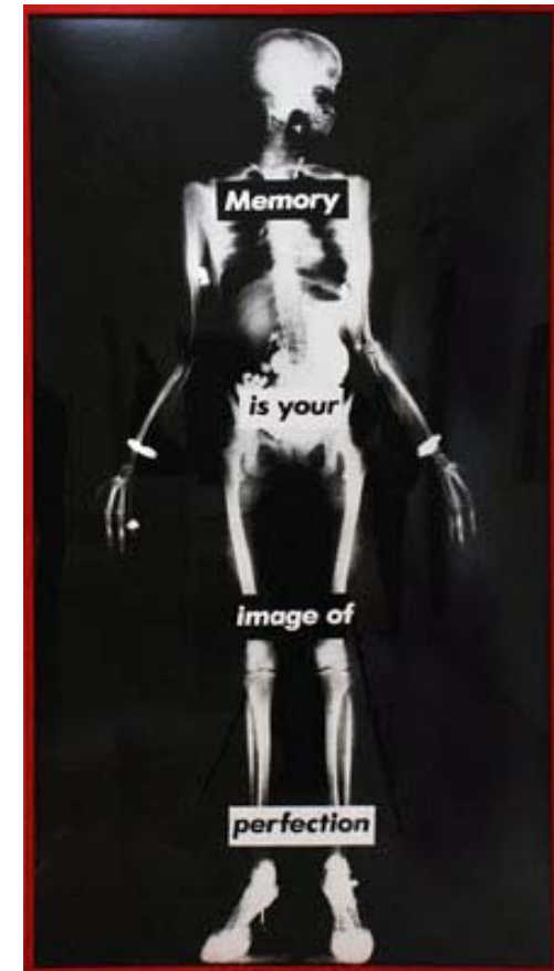
Barbara Kruger - USA